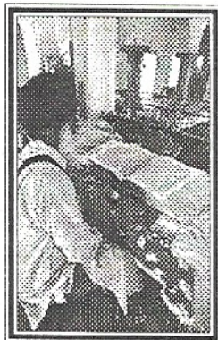
August 1604 - First Opening of Guru Granth Sahib in Harmandir Sahib

Please do not throw away - pass on to someone else.