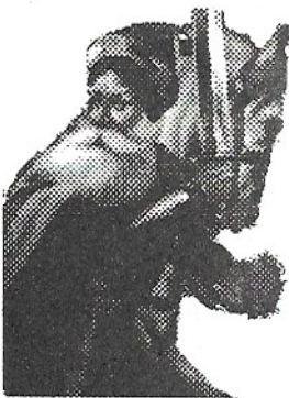
Baba Deep Singh Ji

This is YOUR newsletter please do send us your comments, articles & poems.